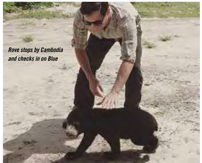
Rove stops by Cambodia and checks in on Blue

Breaking News: A tiny female Sun bear cub was handed over into our care on Monday 20th July. The cub had been captured by ethnic minority hunters in Mondulakiri province and sold to a provincial official who feared that she might be sold into the restaurant trade if he did not purchase her. Sadly this happens all too often in Cambodia, and although we're glad the cub avoided the cooking pot it would have been much better if the Wildlife Rapid Rescue Team had been called to seize the cub - thereby providing a deterrent to anyone thinking about hunting bears in Mondulakiri. The cub appears to be in good health - we'll have more updates for you in the next issue of Bears Print.