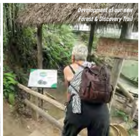
Development of our new Forest & Discovery Trail