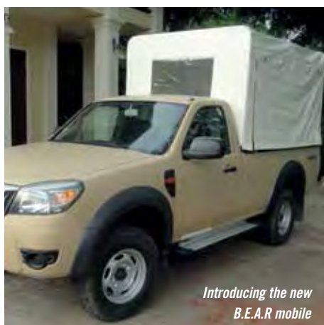
Introducing the new B.E.A.R mobile

As mentioned above, we held a Short Story writing contest, the theme of which was "Laos Bears Belong in Laos Forests". While some of the stories were a bit off the mark, there is one we plan to develop further into a children's book with illustrations and informational text boxes detailing the plight of bears. It will be somewhat of a slow process, as any publication here in Lao PDR needs government approval. So please bear with us and stay tuned!