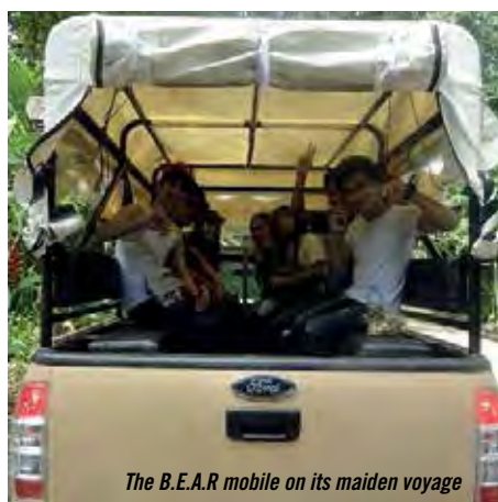
The B.E.A.R mobile on its maiden voyage