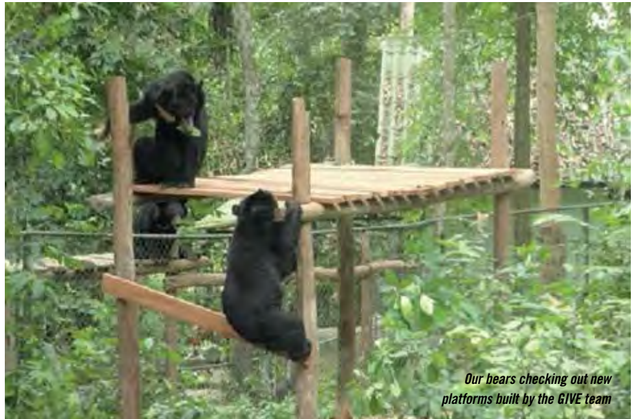
Our bears checking out new platforms built by the GIVE team

This year we partnered with Green International Volunteer Expeditions (GIVE), a non-profit organization from Seattle in the USA. Thus far we have hosted four groups who spend a day volunteering at the centre before taking a well-earned dip in the refreshingly cold waters of Tat Kuang Si's famous waterfalls.