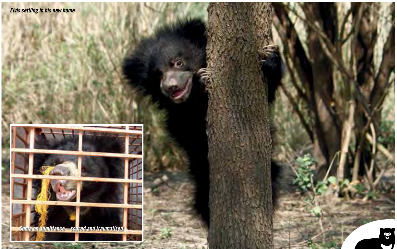
Elvis settling in his new home

Sadly, Jojo showed signs of illness and preliminary medical examinations confirmed the presence of a wild strain of tuberculosis. The treatment for the disease didn't seem to agree with him, and his condition continued to deteriorate steadily until he passed away. While we are deeply saddened by his demise and will miss Jojo terribly, we applaud his strength and perseverance during this long struggle and take solace in knowing that he is finally out of pain and at peace.