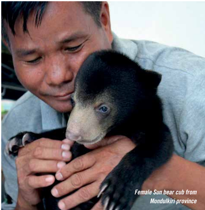
Female Sun bear cub from Mondulakiri province

As always, our volunteers continue to play a big role in the daily care of the bears at our sanctuaries and so we were thrilled to welcome our 500th volunteer in Cambodia recently. Since launching the volunteer programme in 2007 we've created a small army of dedicated ambassadors for our cause, coming from over 35 different countries but all united by their passion for the bears. Our volunteers often describe their experiences as "life-changing" and we cannot argue with that - for the bears whose lives are improved through all their hard work, we'd like to say a big THANK YOU to all of our volunteers, past and present!